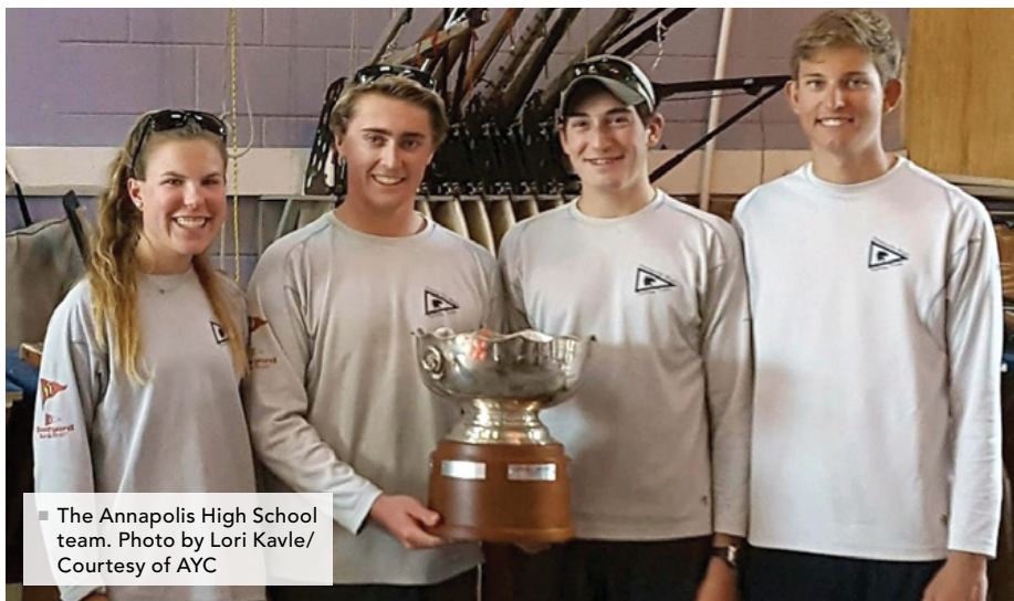
■ The Annapolis High School team.

On day two, the weather was much more favorable for the final day of racing. Race five was started promptly with 10-14 knots of breeze from the southwest. Races six through eight saw a building breeze, up to 16 to 20 knots out of the west as the front approached.